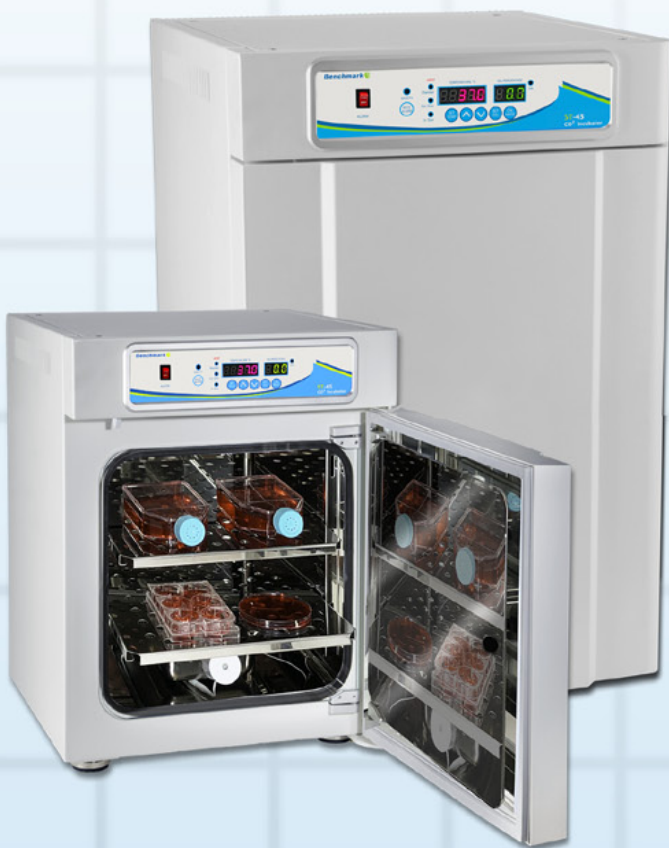
ST Series (ST-45 and ST-180)