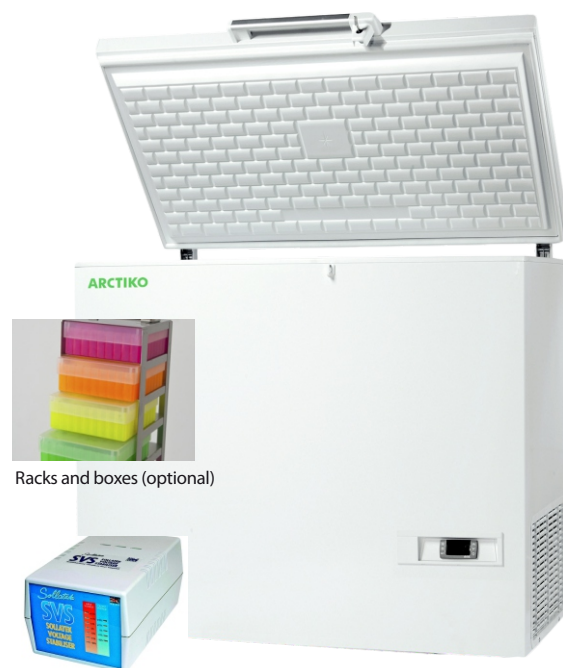
Racks and boxes (optional)

As a synonym for security, the SF series gives reliable low temperature freezing, with good temperature uniformity. Digital display, alarms, contact for remote monitoring, basket(s) and castors are some of the standards.