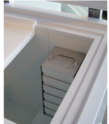
Inner lids (left hand side) which are mandatory for optimized function